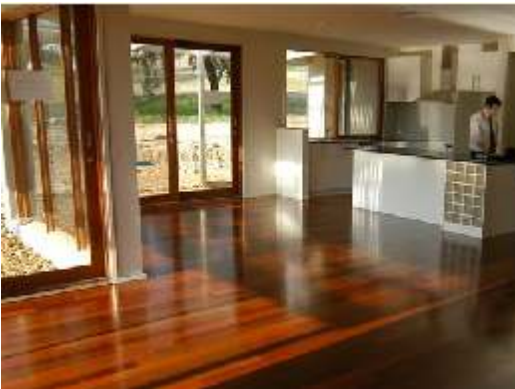
Treatex® Hardwax Oil Gloss