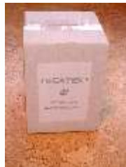
Cleaning and Maintenance Products